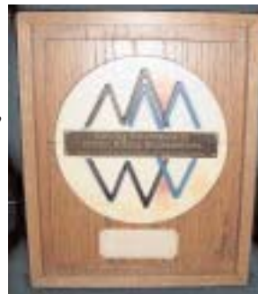
A replica of the WVACHE recognition plaque presented to each Outstanding High School Teacher.

Next year's award nomination forms for Outstanding Teacher, Guidance Counselor and Administrator will be distributed in spring 2003. Winners in all three categories will be announced at the Tenth Annual OACHE/WVACHE Conference, to be held in Lewisburg, West Virginia at Greenbrier Community College Center, a branch of Bluefield State College. Plan now to nominate an outstanding teacher, guidance counselor or administrator from your school! ◀